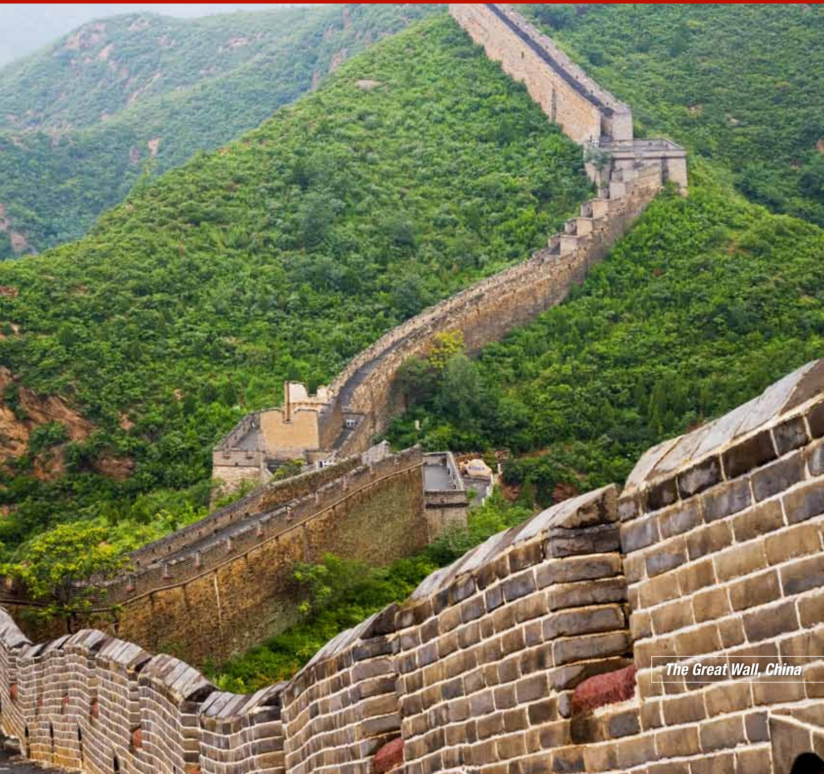
The Great Wall, China